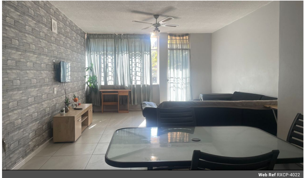
Web Ref RXCP-4022