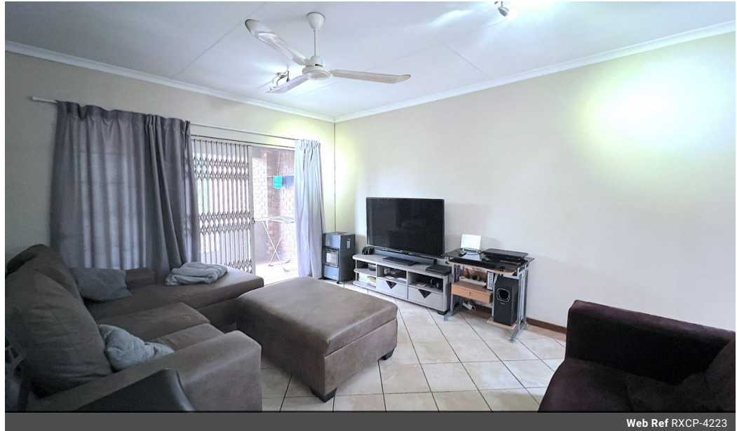
Web Ref RXCP-4223