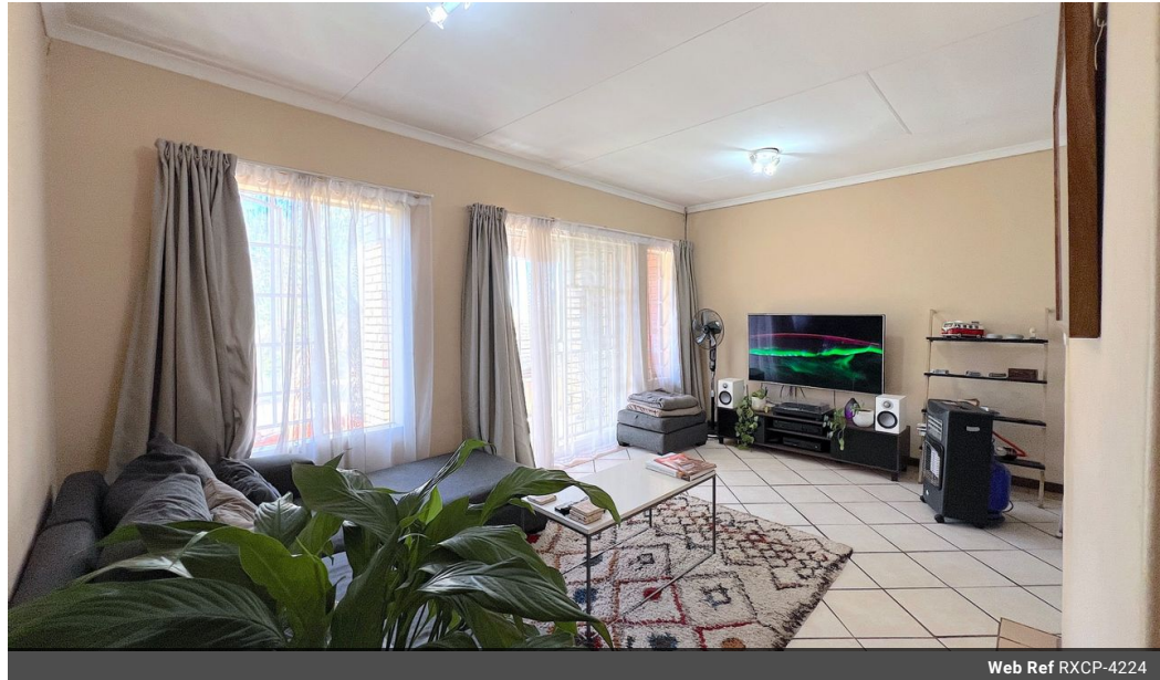
Web Ref RXCP-4224