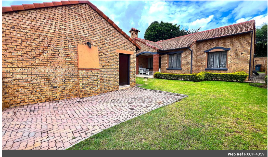
Web Ref RXCP-4359