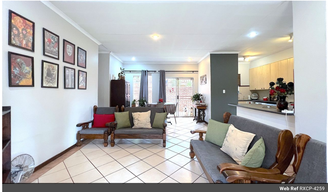
Web Ref RXCP-4259