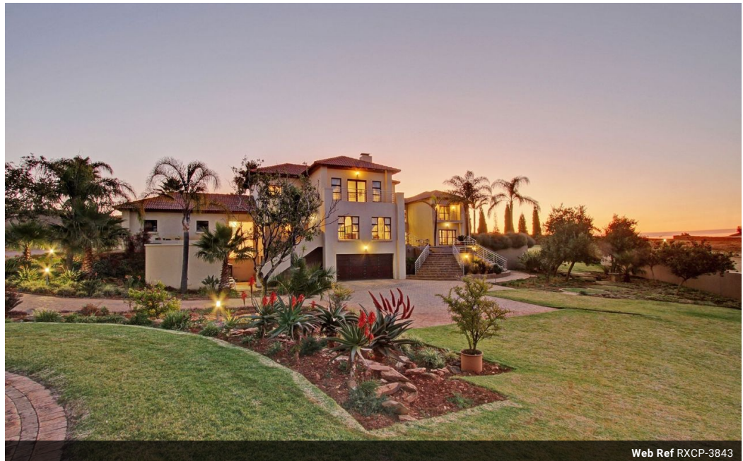
Web Ref RXCP-3843