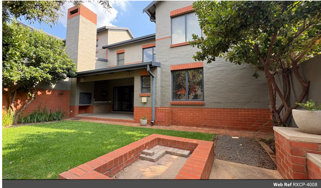
Web Ref RXCP-4008